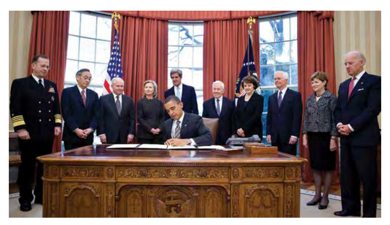
Why would the Constitution require the president and Congress to share power when negotiating treaties with other nations?

The president also can send and receive ambassadors to and from other countries. The president has the power to pardon people convicted of crimes against the United States.