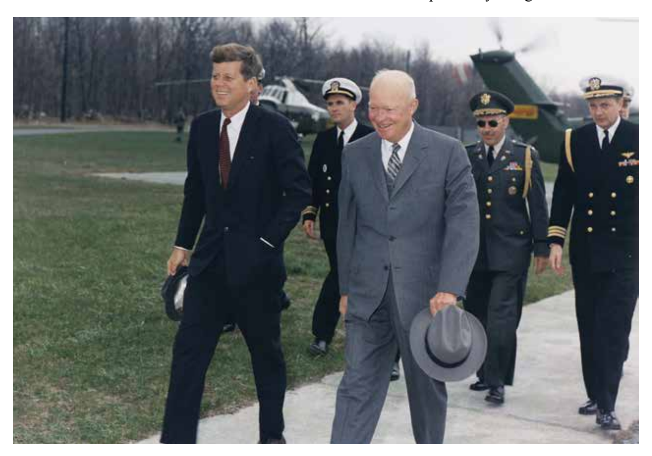
Is it important that the commander in chief of the armed forces is a civilian? Why or why not?