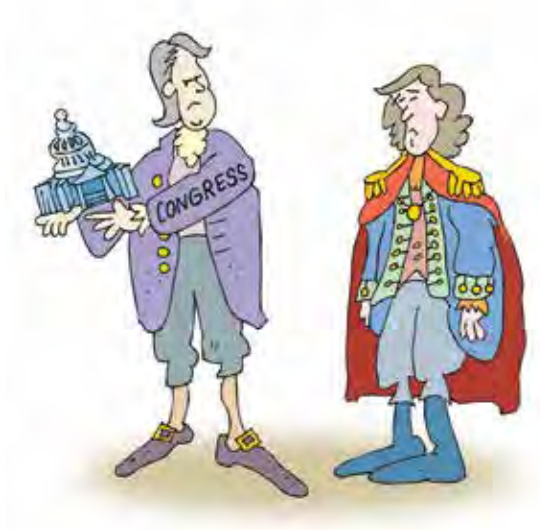
Why did the Framers allow presidents the power to veto laws passed by Congress?

president of serious crimes. The Senate then holds a trial. If the Senate finds the president guilty, he or she can be removed from office. While it is rarely used, impeachment is an important power that Congress has for checking the power of the executive branch.