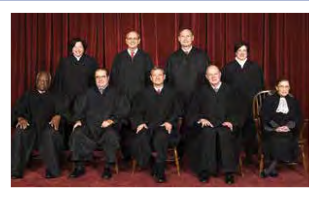
Why do you think the Framers wanted Supreme Court justices to be appointed, rather than elected?

• In all other cases, the U.S. Supreme Court has appellate jurisdiction . The case is tried first in a lower court. Then the decision of the lower court is appealed to the U.S. Supreme Court. The Supreme Court may decide whether to hear a case on appeal.